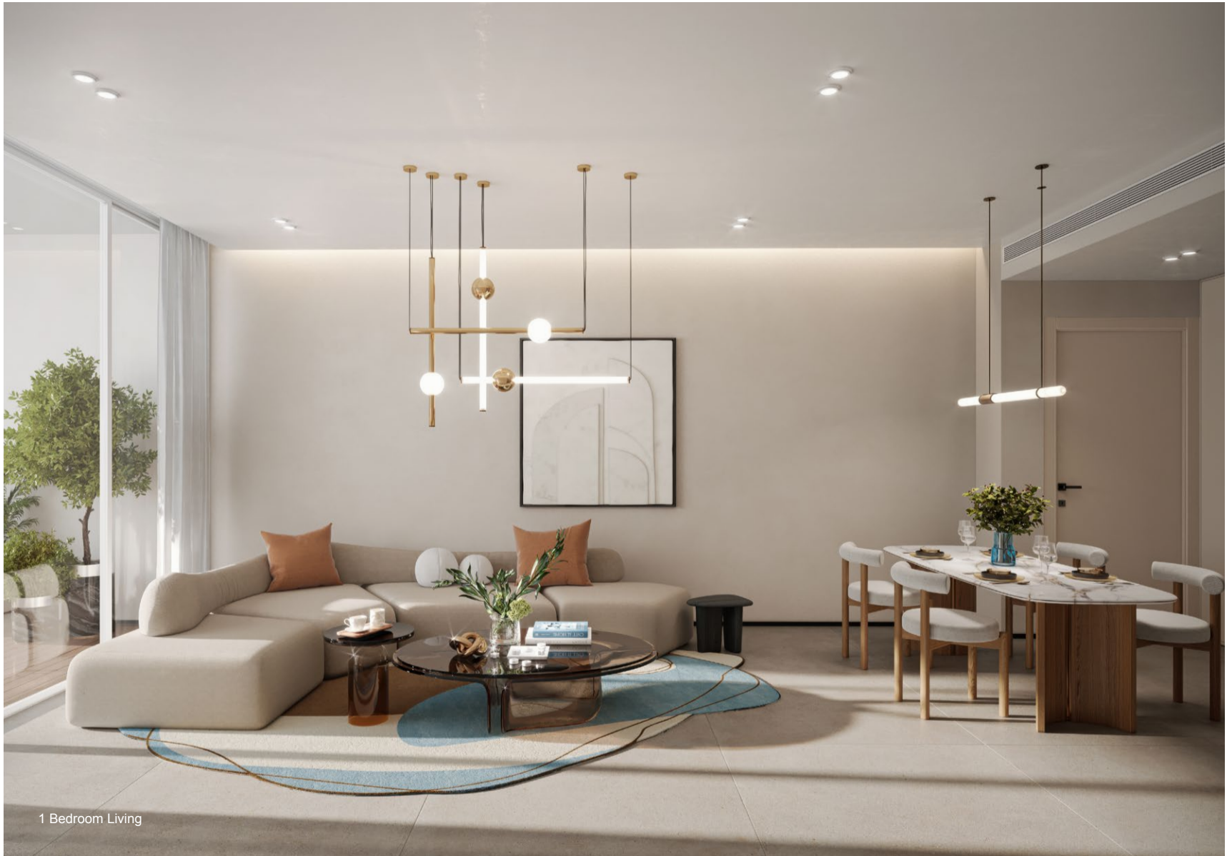
1 Bedroom Living