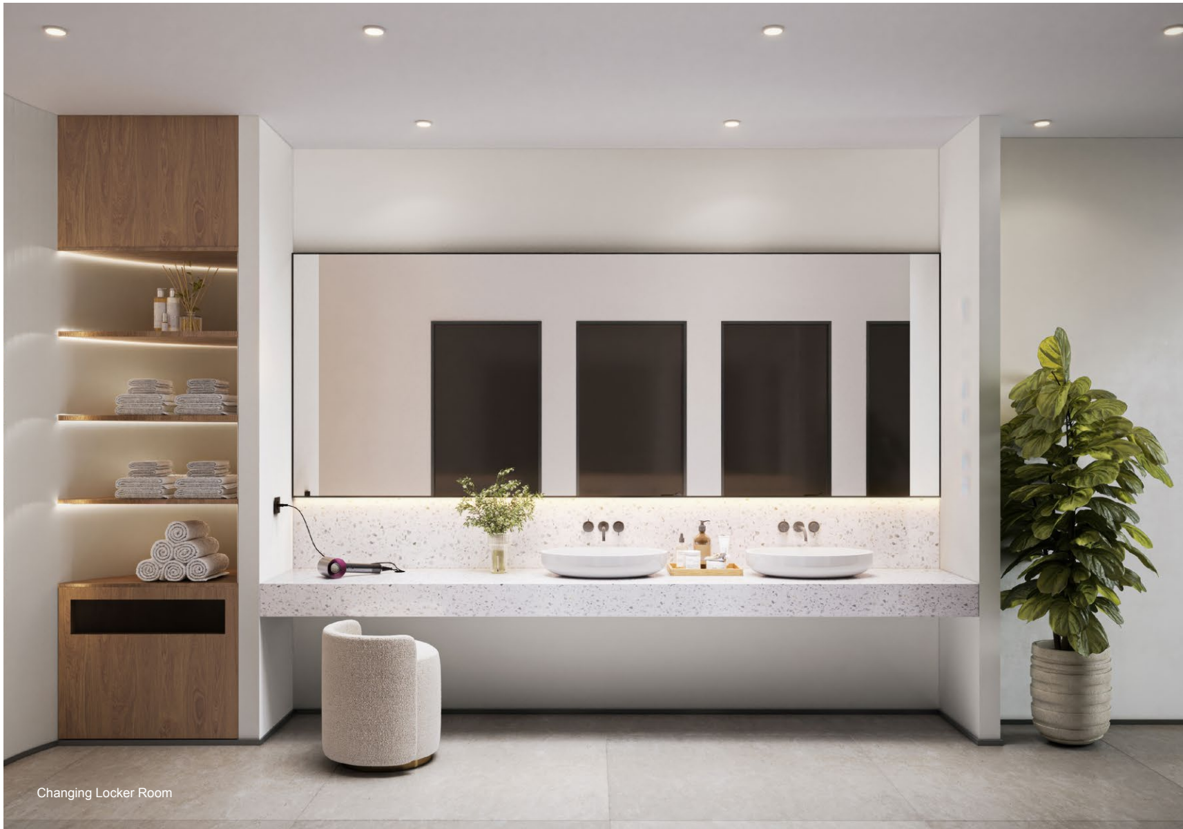
Changing Locker Room