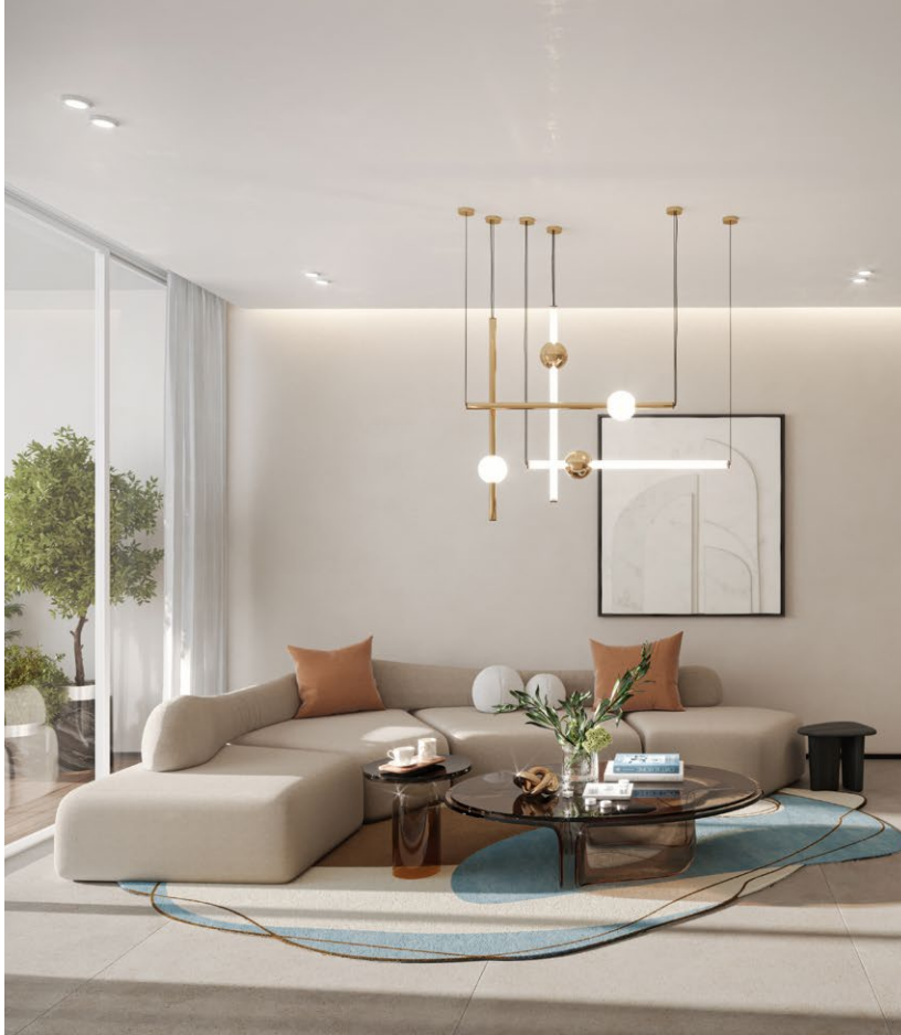
Enjoy sophisticated charm and inviting living spaces at Val, perfect for relaxation and entertainment.