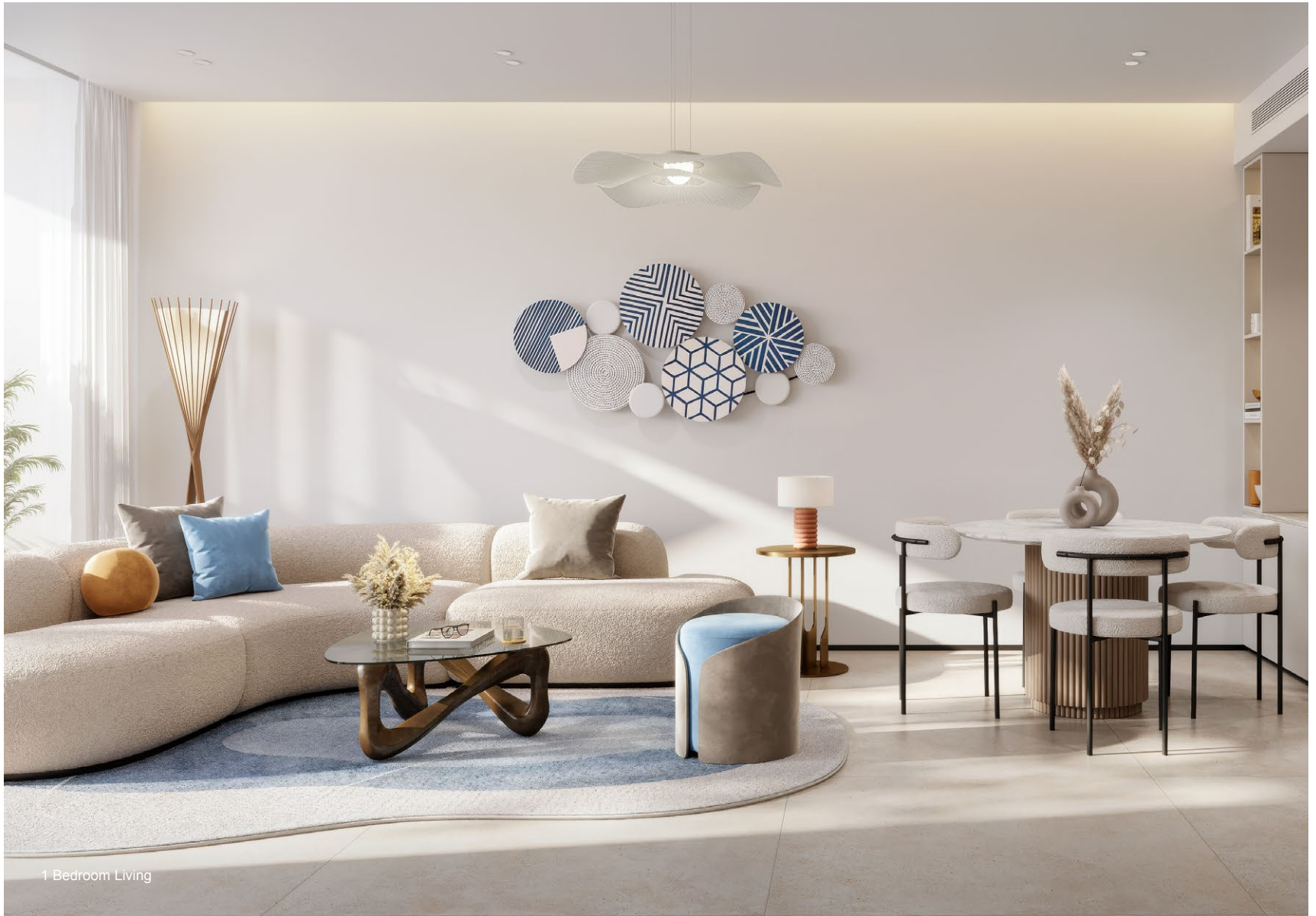
1 Bedroom Living