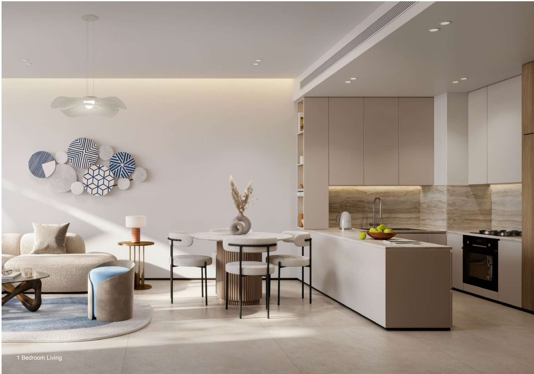
1 Bedroom Living