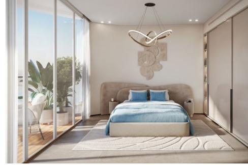
Large windows offer stunning views of the city, while the modern finishes and neutral color palette create a serene atmosphere.